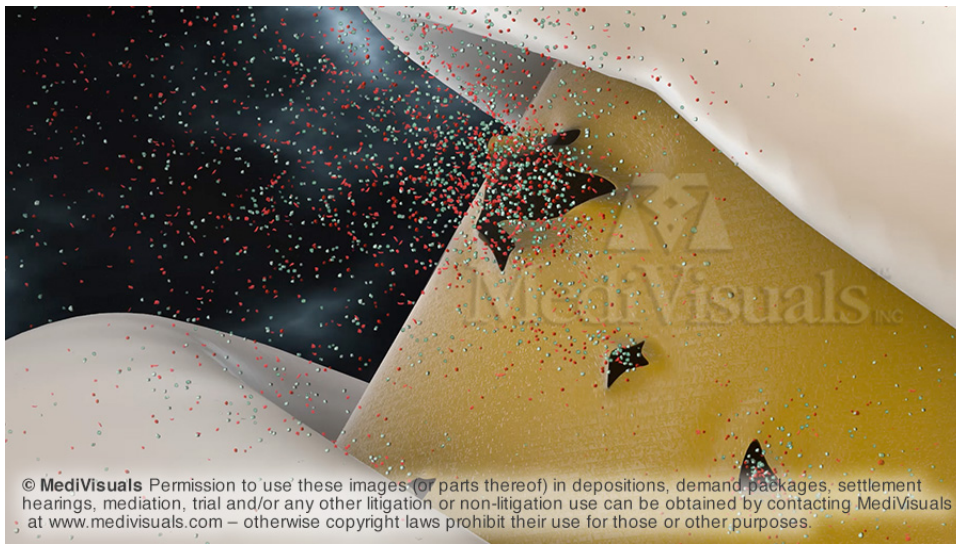
Figure 2: Release of self-destructive substances from injured axon into surrounding fluid, where they are transported to and begin to break down nearby, healthy, functional axons.

Injured axons may partially heal and form terminal bulbs. During the destructive process and attempted healing process, the injured axons continue to receive and carry excitatory impulses. Unfortunately, as these impulses reach the injured end of the axon or the bulb, they are unable to continue across the site of disruption, and the chemical and electrical impulses are arbitrarily released. Due to a process referred to as "excitotoxicity", these substances damage and destroy nearby axons that may have been unharmed and perfectly functional prior to this "attack".