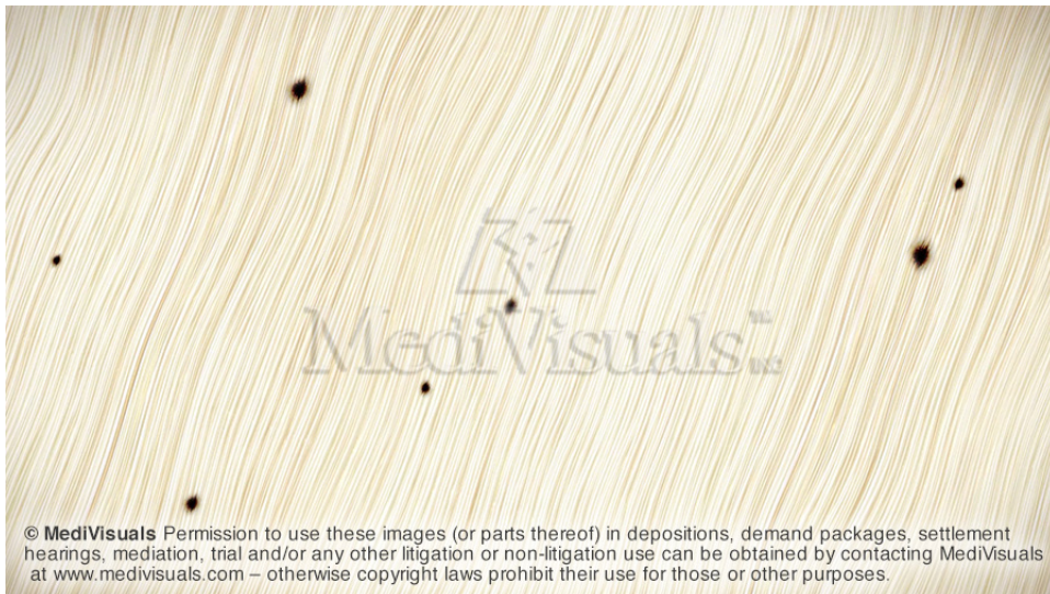
Figure 5: Multiple microscopic islands of injured axons, each consisting of hundreds, thousands, or even tens of thousands of axons – all too small to be visible on typical MRIs.

The injury process can begin in isolated pockets, or “islands”, and spread to other areas throughout the brain. These multiple, widespread lesions are often referred to as "traumatic axonal injury" or "diffuse axonal injury". Each island of injury may involve from only a few axons, to thousands, or even tens of thousands. Because typical MRIs can only detect lesions that are about the size of the head of a pin, and tens of thousands of axons can fit through an area the size of the head of a pin, MRIs are typically interpreted as negative for TBI, even though hundreds of thousands, or even millions, of axons could be injured across the scattered areas of "traumatic axonal injury".