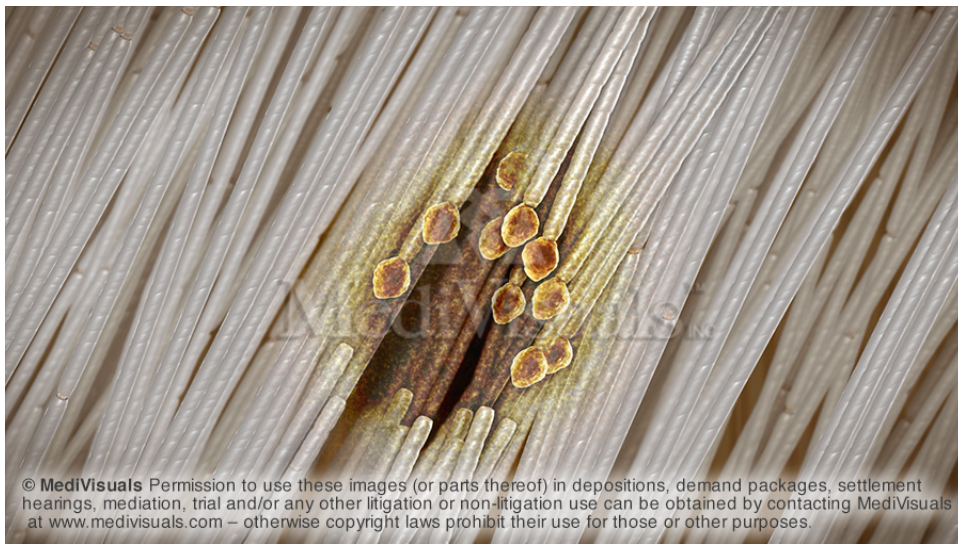
Figure 4: "Island" of spreading injured axons and terminal bulbs.

The injury process can begin in isolated pockets, or “islands”, and spread to other areas throughout the brain. These multiple, widespread lesions are often referred to as "traumatic axonal injury" or "diffuse axonal injury". Each island of injury may involve from only a few axons, to thousands, or even tens of thousands. Because typical MRIs can only detect lesions that are about the size of the head of a pin, and tens of thousands of axons can fit through an area the size of the head of a pin, MRIs are typically interpreted as negative for TBI, even though hundreds of thousands, or even millions, of axons could be injured across the scattered areas of "traumatic axonal injury".